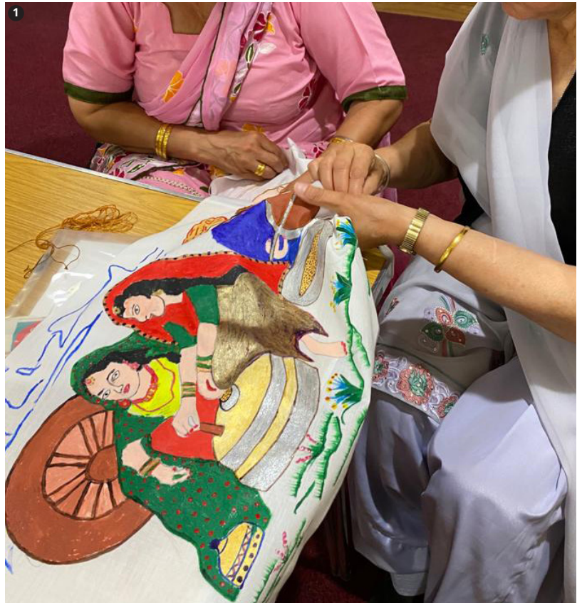
[images] 1. Fabric Painting Workshop: Sikh Academy, Smethwick 2023 2. Rangoli Workshop: MAC, Birmingham 2019 3. Sewing Rangoli Workshop: New Indian Art Gallery, Birmingham 2008 4. Block Printing Workshop: Sunderland Museum & Art Gallery, Sunderland 2018 5. Textile Workshop: MAC, Birmingham 2022

My passion for sharing cultural insights inspired me to create workshops that empower children and adults to explore and appreciate traditional Indian arts and crafts.