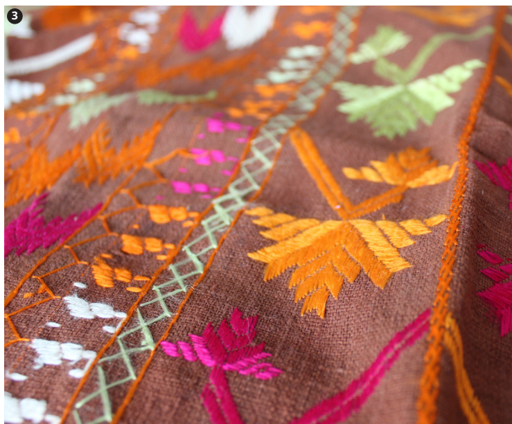
[images] 1. Contemporary 3 Panel Peacock Themed Screen 2. Traditional Wall Hanging 3. Section of a traditional Indian dress

Phulkari: blooming with colour and symbolism, phulkari transforms cloth into living art. Each stitch is a petal, each pattern a story. These textiles are more than adornment; they are vessels of memory, joy, and cultural heritage.