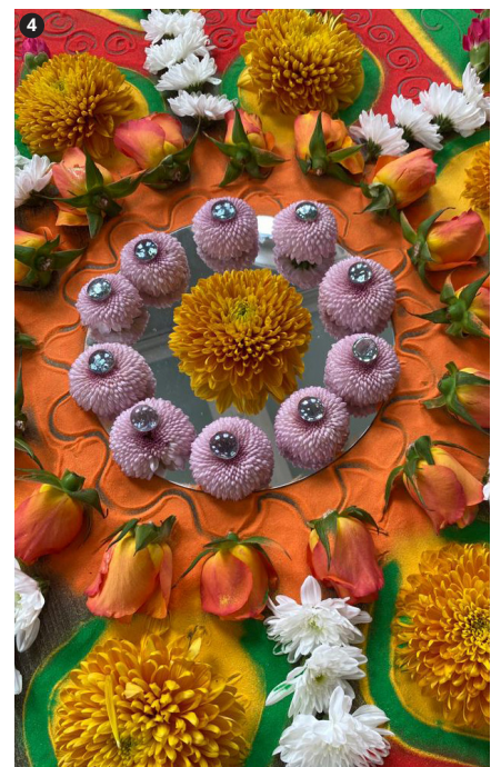
[images] 1. Fresh Flower Rangoli: Art in the Park, Leamington Spa 2021 2. Coloured Rice Rangoli: Diwali themed packaging, Sainsbury's 2022 3. Grain Rangoli: WOMAD 40th Anniversary, Somerset 2022 4. Fresh Flower Rangoli: Wednesbury Library 2023