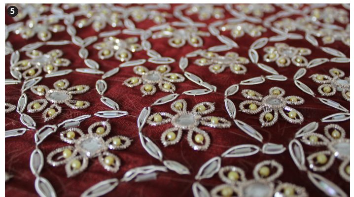
[images] 1. Scarf: running and herring bone stitch 2. Wall Hanging: sequins and mirrors 3. Table Cloth: chain stitch 4. Wall Hanging: fabric print with beads and sequins 5. Table Runner: filigree stitches featuring beads