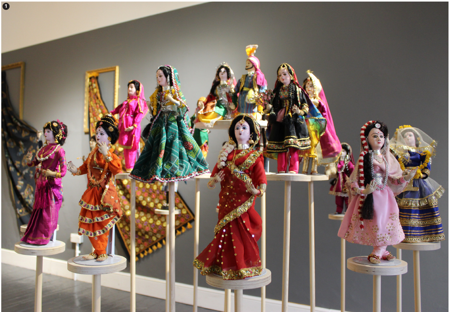
[images] 1. Handmade Dolls: depicting individual states and dancers of India 2. Handmade Rajasthan Doll 3. Handmade Indian Bride Doll 4. Handmade Traditional Village Scene